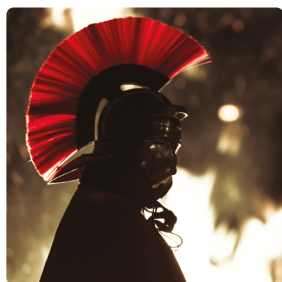
I am Warrior!